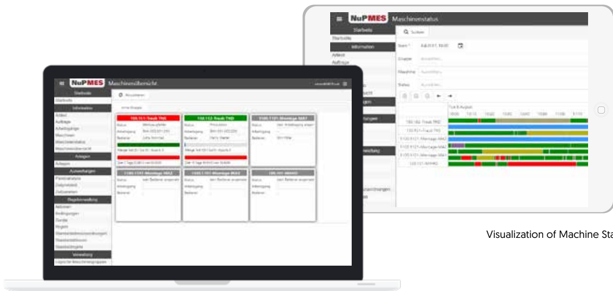
Visualization of Machine Status