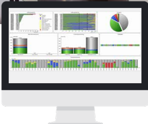
Dynamic Visualization of relevant KPIs